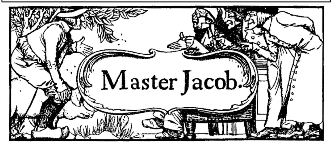
By Howard Pyle In the Public Domain

Once upon a time there was a man whose name was just Master Jacob and nothing more.